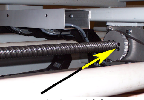
LONG AXIS (Y)