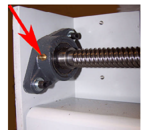
END BEARINGS (REAR VIEWS OF X-AXIS)