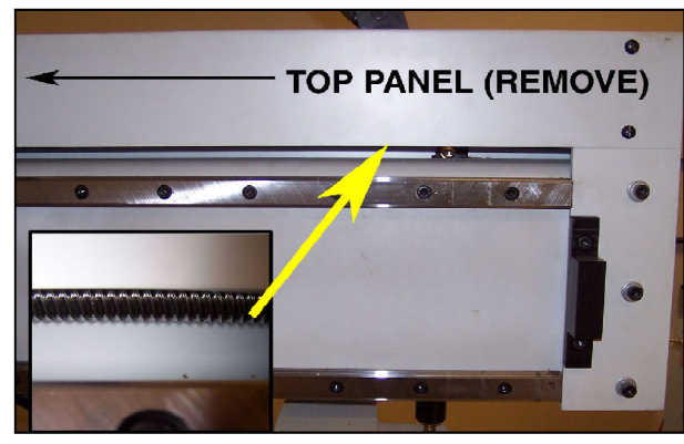
X-AXIS (FRONT VIEW)