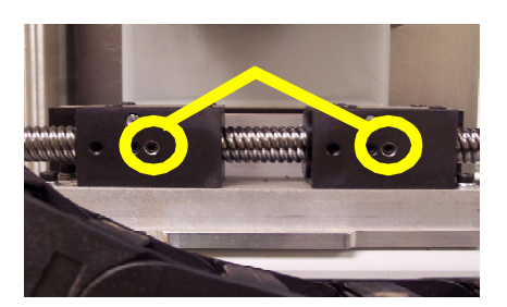
X-AXIS BALL NUTS (REAR VIEW)